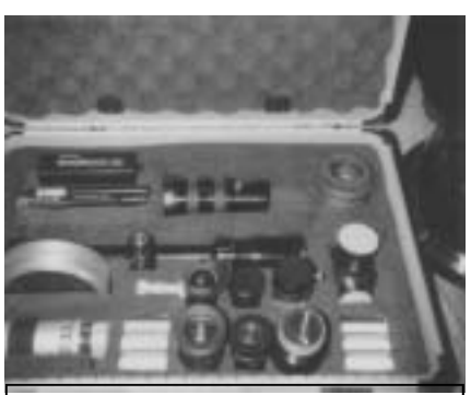
Layout of telescope OTA and accessory carry case for Celestron 80mm F5. The top row of accessories and foam may be removed to accommodate OTA. Note 3-9x/22mm riflescope finder, E6 roof prism erector, 25mm & 5mm crosshair eyepieces, 48mm Lumicon/Minos Violet filter on order (visual/photo color corrector filter).

I've opted for less expensive, but full use eyepieces, such as the new fully multi-coated Highlight Plössl and long eye relief (20mm) ED glass EPIC eyepieces from Orion.