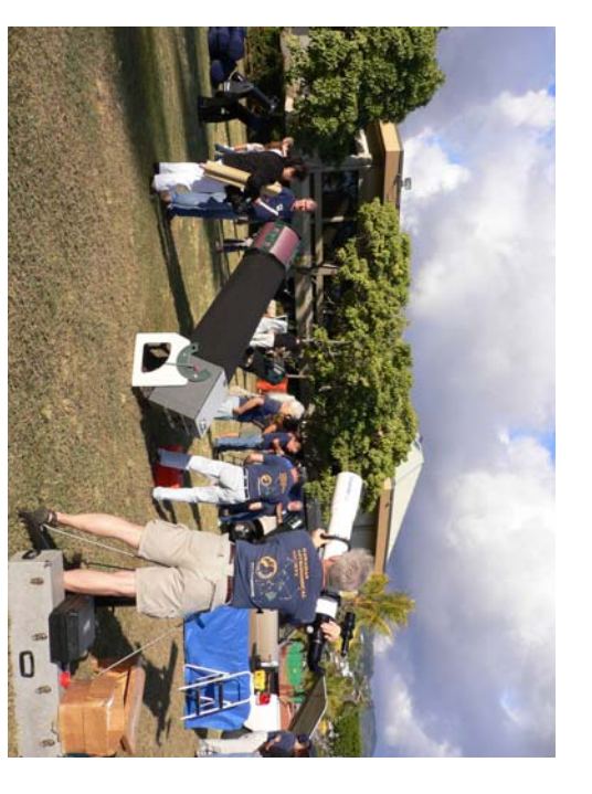
HAS Members preparing for a public event to view the Deep Impact Mission from the great lawn at Bishop Museum

Place stamp here. Post Office will not deliver mail without proper postage